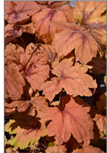
Pumpkin Spice Foamy Bells foliage

Pumpkin Spice Foamy Bells is recommended for the following landscape applications;