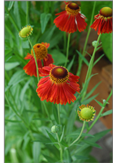
Moerheim Beauty Sneezeweed flowers