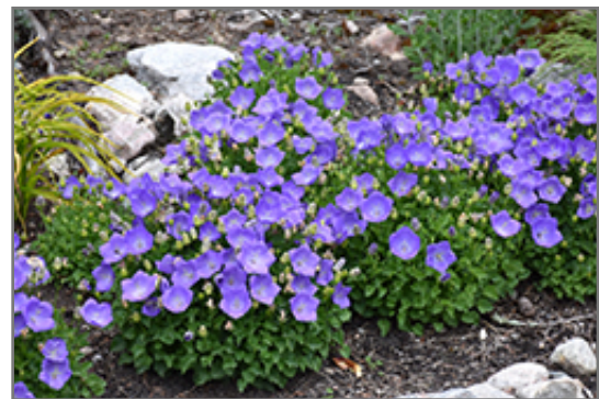
Rapido Blue Bellflower in bloom