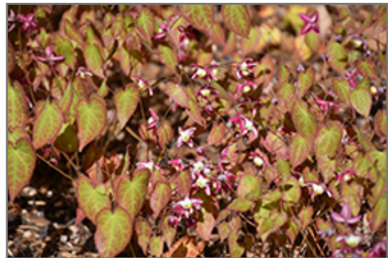
Bishop's Hat in bloom