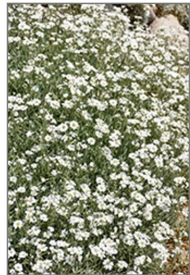
Snow-In-Summer in bloom