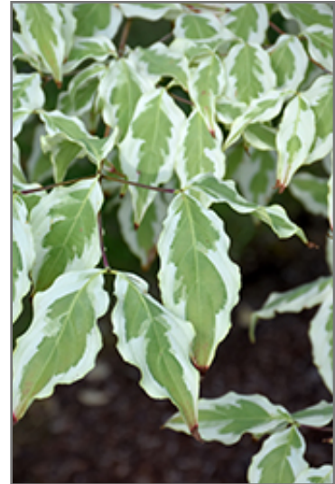
Summer Fun Chinese Dogwood foliage