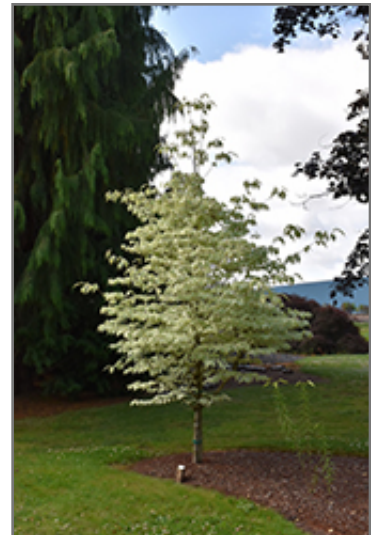
Summer Fun Chinese Dogwood