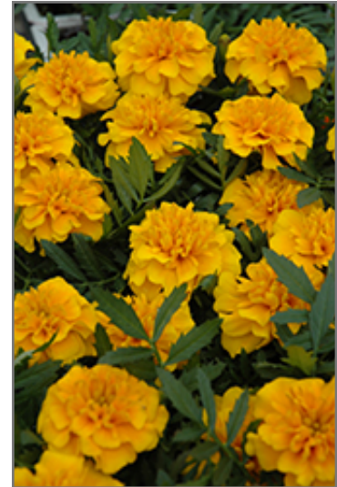
Bonanza Gold Marigold flowers

Bonanza Gold Marigold will grow to be about 12 inches tall at maturity, with a spread of 8 inches. When grown in masses or used as a bedding plant, individual plants should be spaced approximately 6 inches apart. Its foliage tends to remain dense right to the ground, not requiring facer plants in front. This fast-growing annual will normally live for one full growing season, needing replacement the following year.