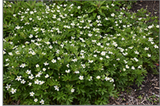
Windflower in bloom

Windflower will grow to be about 12 inches tall at maturity, with a spread of 18 inches. Its foliage tends to remain dense right to the ground, not requiring facer plants in front. It grows at a fast rate, and under ideal conditions can be expected to live for approximately 10 years. As an herbaceous perennial, this plant will usually die back to the crown each winter, and will regrow from the base each spring. Be careful not to disturb the crown in late winter when it may not be readily seen!