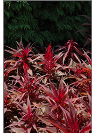
Dragon's Breath Plumed Celosia flowers

Dragon's Breath Plumed Celosia is recommended for the following landscape applications;