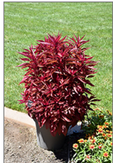
Dragon's Breath Plumed Celosia