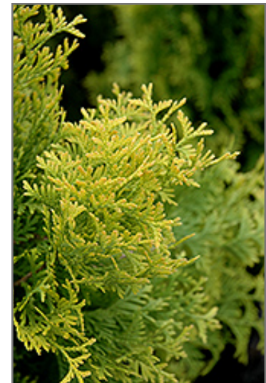
Amber Gold Arborvitae foliage