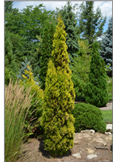
Amber Gold Arborvitae