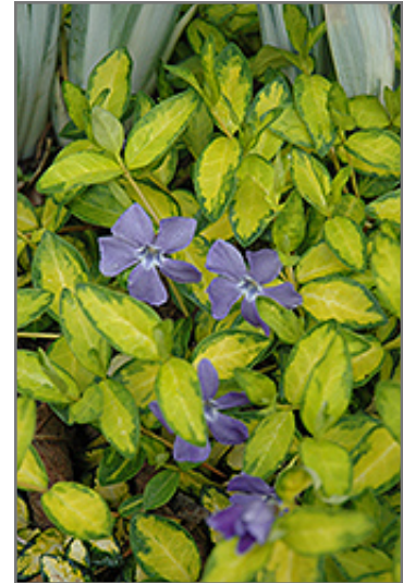
Illumination Periwinkle flowers

Illumination Periwinkle is a fine choice for the garden, but it is also a good selection for planting in outdoor pots and containers. Because of its spreading habit of growth, it is ideally suited for use as a 'spiller' in the 'spiller-thriller-filler' container combination; plant it near the edges where it can spill gracefully over the pot. Note that when growing plants in outdoor containers and baskets, they may require more frequent waterings than they would in the yard or garden. Be aware that in our climate, most plants cannot be expected to survive the winter if left in containers outdoors, and this plant is no exception. Contact our experts for more information on how to protect it over the winter months.