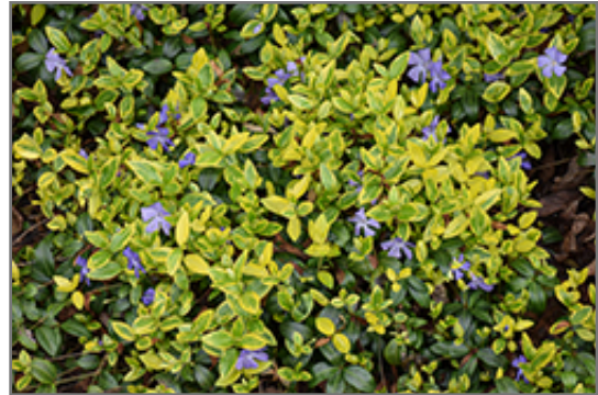
Illumination Periwinkle in bloom