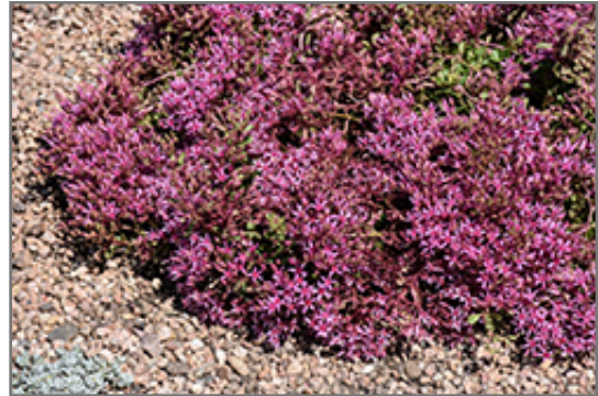
Dragon's Blood Stonecrop flowers