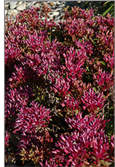
Dragon's Blood Stonecrop in bloom

Dragon's Blood Stonecrop is a fine choice for the garden, but it is also a good selection for planting in outdoor pots and containers. Because of its spreading habit of growth, it is ideally suited for use as a 'spiller' in the 'spiller-thriller-filler' container combination; plant it near the edges where it can spill gracefully over the pot. Note that when growing plants in outdoor containers and baskets, they may require more frequent waterings than they would in the yard or garden. Be aware that in our climate, most plants cannot be expected to survive the winter if left in containers outdoors, and this plant is no exception. Contact our experts for more information on how to protect it over the winter months.