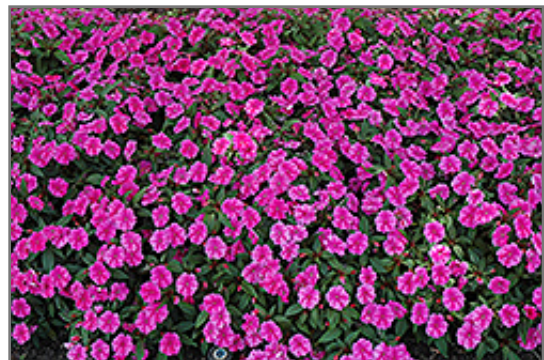
Bounce Pink Flame Impatiens in bloom