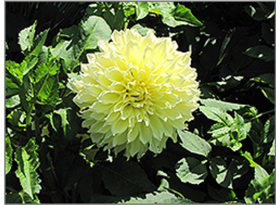
Kelvin Floodlight Dahlia flowers

Kelvin Floodlight Dahlia will grow to be about 4 feet tall at maturity, with a spread of 24 inches. The flower stalks can be weak and so it may require staking in exposed sites or excessively rich soils. Although it's not a true annual, this plant can be expected to behave as an annual in our climate if left outdoors over the winter, usually needing replacement the following year. As such, gardeners should take into consideration that it will perform differently than it would in its native habitat.