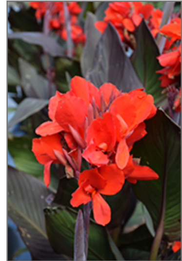
Cannova Bronze Scarlet Canna flowers

This plant is native to the tropics and prefers growing in moist environments with evenly warm conditions all year round. In our climate, it is usually grown as an outdoor annual in the garden or in a container. If you want it to survive the winter, it can be brought in to the house and provided with special care, and then returned to the garden the following season. In its preferred tropical habitat, it can grow to be around 4 feet tall at maturity, with a spread of 20 inches. However, when grown as an annual or when overwintered indoors, it can be expected to perform differently, and its exact height and spread will depend on many factors; you may wish to consult with our experts as to how it might perform in your specific application and growing conditions.