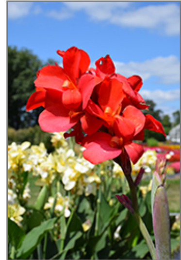
Cannova Bronze Scarlet Canna flowers

Cannova Bronze Scarlet Canna is a fine choice for the garden, but it is also a good selection for planting in outdoor pots and containers. With its upright habit of growth, it is best suited for use as a 'thriller' in the 'spiller-thriller-filler' container combination; plant it near the center of the pot, surrounded by smaller plants and those that spill over the edges. It is even sizeable enough that it can be grown alone in a suitable container. Note that when growing plants in outdoor containers and baskets, they may require more frequent waterings than they would in the yard or garden. Be aware that in our climate, most plants cannot be expected to survive the winter if left in containers outdoors, and this plant is no exception. Contact our experts for more information on how to protect it over the winter months.