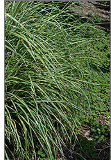
Little Zebra Dwarf Maiden Grass foliage