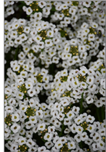
Stream White Sweet Alyssum flowers

Stream White Sweet Alyssum is recommended for the following landscape applications;