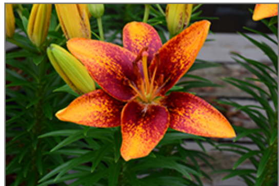
Lily Looks Tiny Orange Sensation Lily flowers