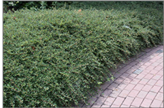
Coral Beauty Cotoneaster