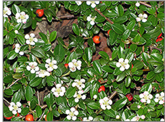
Coral Beauty Cotoneaster fruit

Coral Beauty Cotoneaster will grow to be about 12 inches tall at maturity, with a spread of 5 feet. It tends to fill out right to the ground and therefore doesn't necessarily require facer plants in front. It grows at a fast rate, and under ideal conditions can be expected to live for approximately 30 years.