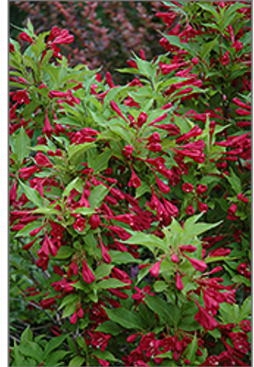
Red Prince Weigela flowers

* This is a 'special order' plant - contact store for details