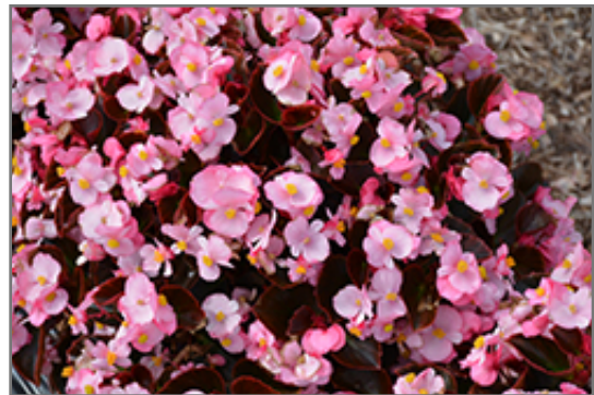
Nightife Pink Begonia flowers