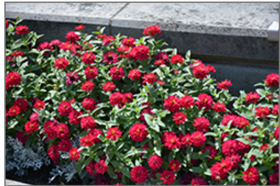
Profusion Double Hot Cherry Zinnia in bloom