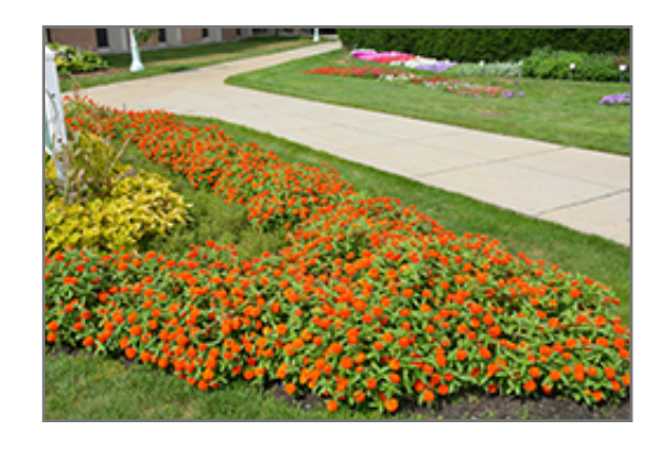
Profusion Double Fire Zinnia in bloom

This plant should only be grown in full sunlight. It does best in average to evenly moist conditions, but will not tolerate standing water. It is not particular as to soil type or pH. It is highly tolerant of urban pollution and will even thrive in inner city environments. This particular variety is an interspecific hybrid.