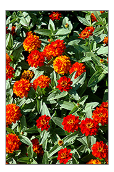
Profusion Double Fire Zinnia flowers