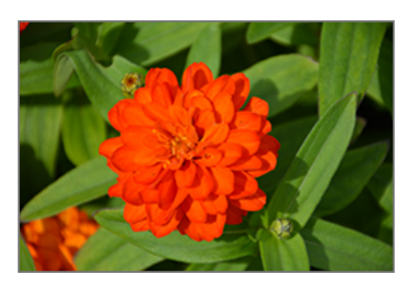
Profusion Double Fire Zinnia flowers