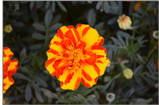
Durango Bolero Marigold flowers