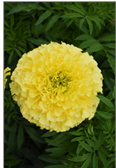
Lady Primrose Marigold flowers