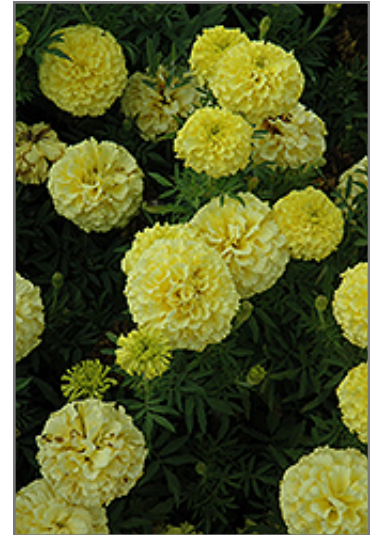
Lady Primrose Marigold flowers