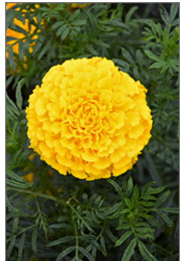
Lady Gold Marigold flowers