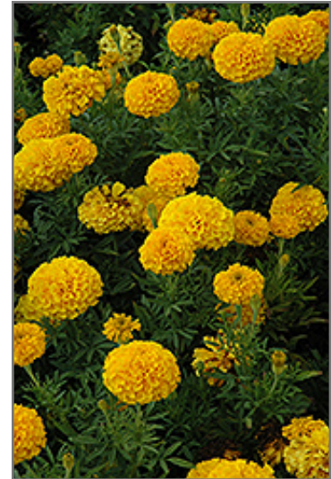
Lady Gold Marigold flowers