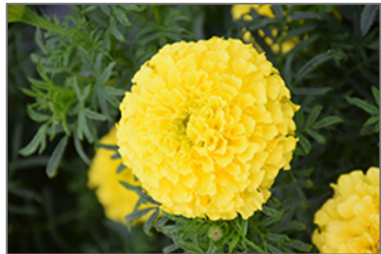
Lady First Marigold flowers