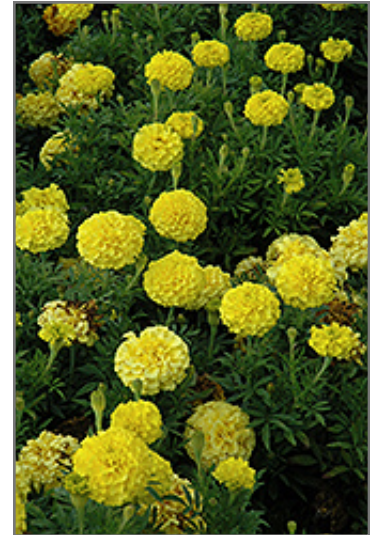
Lady First Marigold flowers