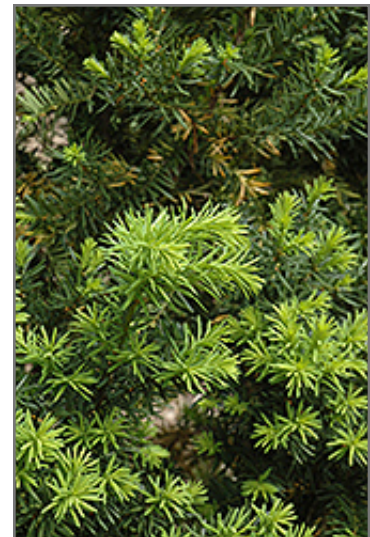
Hicks Yew foliage