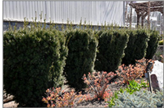
Hicks Yew

This shrub performs well in both full sun and full shade. However, you may want to keep it away from hot, dry locations that receive direct afternoon sun or which get reflected sunlight, such as against the south side of a white wall. It does best in average to evenly moist conditions, but will not tolerate standing water. It is not particular as to soil type or pH. It is highly tolerant of urban pollution and will even thrive in inner city environments, and will benefit from being planted in a relatively sheltered location. Consider applying a thick mulch around the root zone in winter to protect it in exposed locations or colder microclimates. This particular variety is an interspecific hybrid, and parts of it are known to be toxic to humans and animals, so care should be exercised in planting it around children and pets.