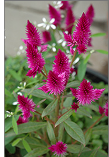
Intenz Classic Celosia flowers

Intenz Classic Celosia is recommended for the following landscape applications;