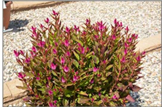
Intenz Classic Celosia in bloom

Intenz Classic Celosia will grow to be about 14 inches tall at maturity, with a spread of 12 inches. When grown in masses or used as a bedding plant, individual plants should be spaced approximately 10 inches apart. Its foliage tends to remain dense right to the ground, not requiring facer plants in front. This fast-growing annual will normally live for one full growing season, needing replacement the following year.