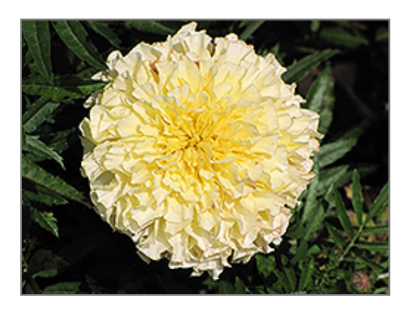
Vanilla Marigold flowers