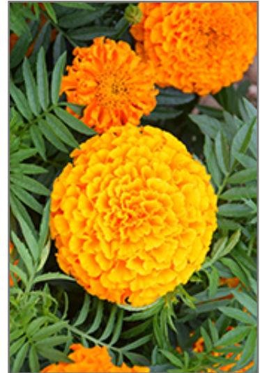
Taishan Orange Marigold flowers