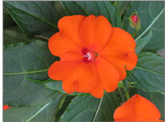
Infinity Orange New Guinea Impatiens flowers

Infinity Orange New Guinea Impatiens is recommended for the following landscape applications;