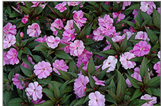
Divine Lavender New Guinea Impatiens flowers