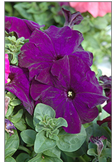
Dreams Midnight Petunia flowers