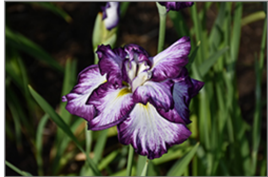
Lion King Japanese Flag Iris flowers

This plant will require occasional maintenance and upkeep, and should be cut back in late fall in preparation for winter. Deer don't particularly care for this plant and will usually leave it alone in favor of tastier treats. Gardeners should be aware of the following characteristic(s) that may warrant special consideration;