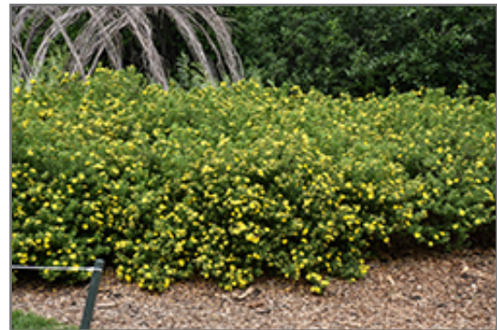
Goldfinger Potentilla in bloom