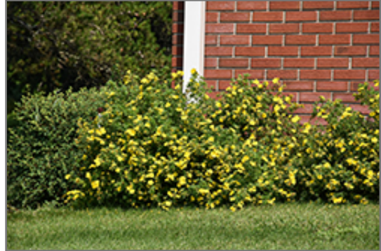
Goldfinger Potentilla in bloom

This shrub does best in full sun to partial shade. It is very adaptable to both dry and moist locations, and should do just fine under typical garden conditions. It is considered to be drought-tolerant, and thus makes an ideal choice for a low-water garden or xeriscape application. It is not particular as to soil type or pH. It is highly tolerant of urban pollution and will even thrive in inner city environments. This is a selection of a native North American species.