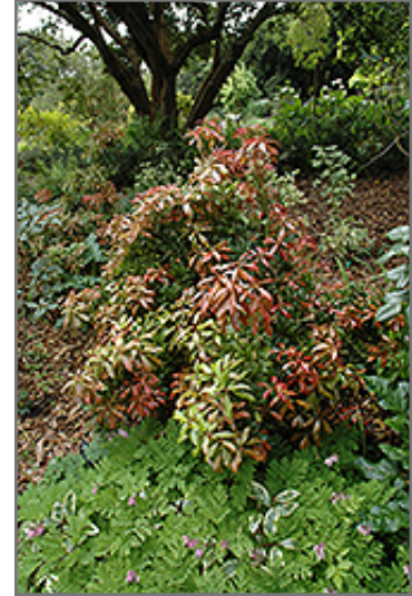
Mountain Fire Japanese Pieris

This shrub does best in full sun to partial shade. It requires an evenly moist well-drained soil for optimal growth, but will die in standing water. It is very fussy about its soil conditions and must have rich, acidic soils to ensure success, and is subject to chlorosis (yellowing) of the foliage in alkaline soils. It is somewhat tolerant of urban pollution, and will benefit from being planted in a relatively sheltered location. Consider applying a thick mulch around the root zone in winter to protect it in exposed locations or colder microclimates. This is a selected variety of a species not originally from North America, and parts of it are known to be toxic to humans and animals, so care should be exercised in planting it around children and pets.