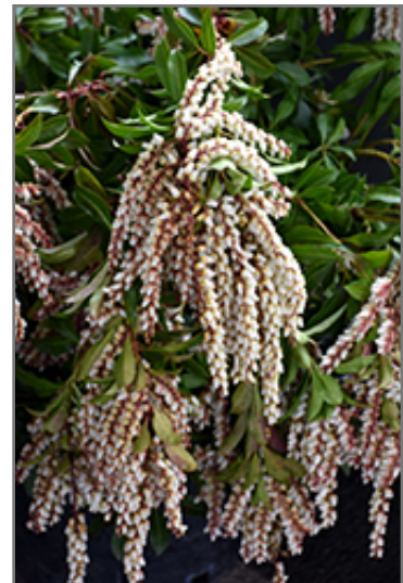
Mountain Fire Japanese Pieris flowers