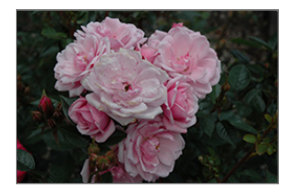
Flower Carpet Appleblossom Rose flowers