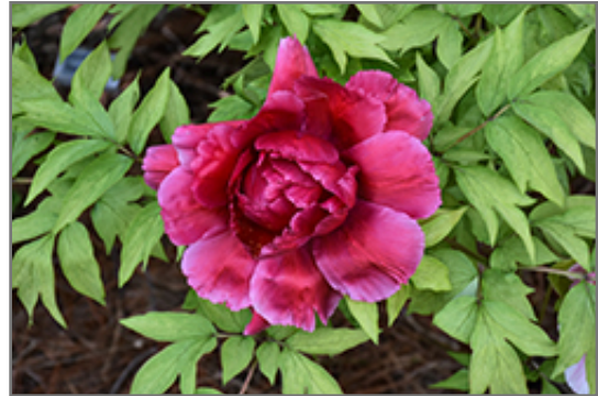
Red Tree Peony flowers

Red Tree Peony will grow to be about 5 feet tall at maturity, with a spread of 5 feet. It has a low canopy, and is suitable for planting under power lines. It grows at a slow rate, and under ideal conditions can be expected to live for approximately 20 years.