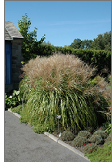
Huron Sunrise Maiden Grass

Huron Sunrise Maiden Grass is recommended for the following landscape applications;