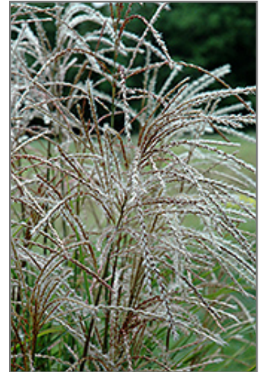
Huron Sunrise Maiden Grass flowers

This plant does best in full sun to partial shade. It prefers to grow in average to moist conditions, and shouldn't be allowed to dry out. It is not particular as to soil type or pH. It is highly tolerant of urban pollution and will even thrive in inner city environments. This is a selected variety of a species not originally from North America. It can be propagated by division; however, as a cultivated variety, be aware that it may be subject to certain restrictions or prohibitions on propagation.