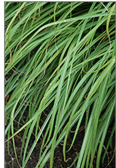
Huron Sunrise Maiden Grass foliage