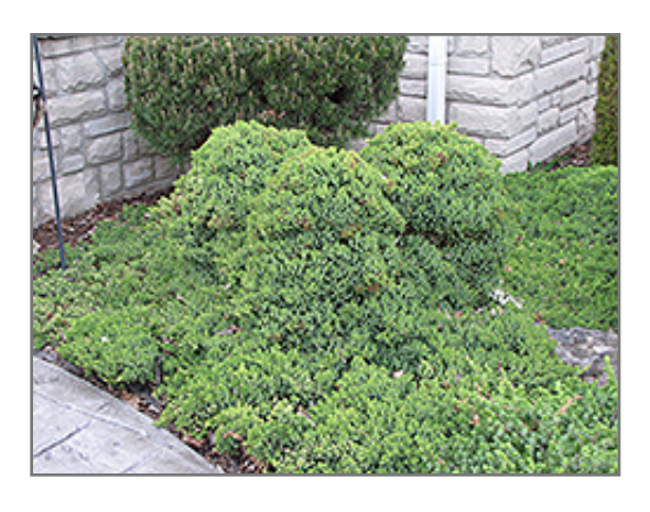
Dwarf Japanese Garden Juniper

Dwarf Japanese Garden Juniper is a dense multi-stemmed evergreen shrub with a ground-hugging habit of growth. It lends an extremely fine and delicate texture to the landscape composition which should be used to full effect.