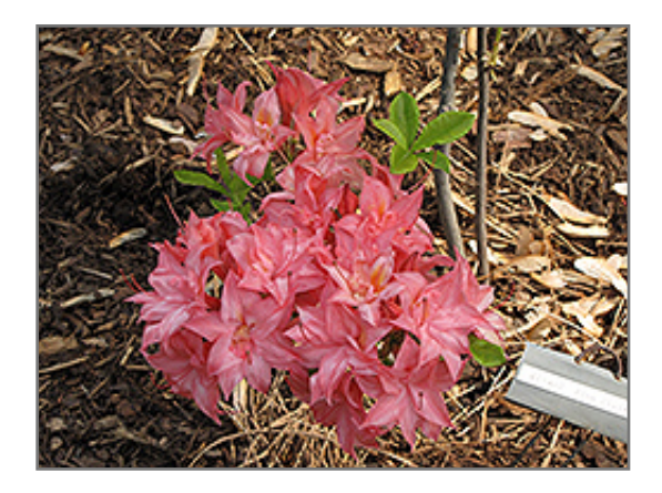
Pink Delight Azalea in bloom

Pink Delight Azalea will grow to be about 4 feet tall at maturity, with a spread of 4 feet. It tends to be a little leggy, with a typical clearance of 1 foot from the ground. It grows at a slow rate, and under ideal conditions can be expected to live for 40 years or more.