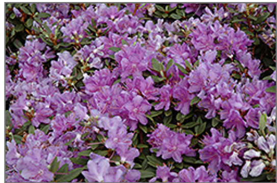
Purple Gem Rhododendron flowers