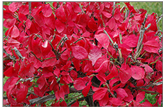
Compact Winged Burning Bush in fall