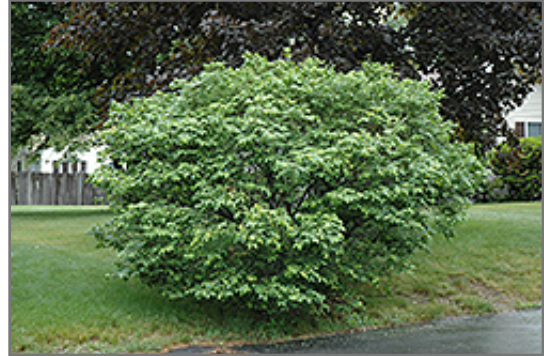
Compact Winged Burning Bush

Compact Winged Burning Bush will grow to be about 7 feet tall at maturity, with a spread of 7 feet. It tends to fill out right to the ground and therefore doesn't necessarily require facer plants in front, and is suitable for planting under power lines. It grows at a slow rate, and under ideal conditions can be expected to live for 50 years or more.