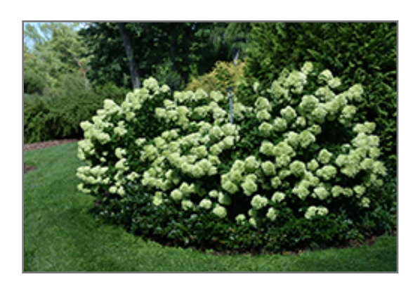
Little Lime Hydrangea in bloom

This shrub performs well in both full sun and full shade. It prefers to grow in average to moist conditions, and shouldn't be allowed to dry out. It is not particular as to soil type or pH. It is highly tolerant of urban pollution and will even thrive in inner city environments. Consider applying a thick mulch around the root zone in winter to protect it in exposed locations or colder microclimates. This is a selected variety of a species not originally from North America.