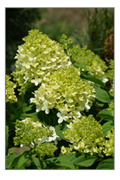
Little Lime Hydrangea flower buds