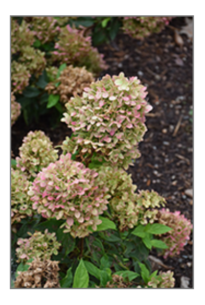
Little Lime Hydrangea flowers (faded)