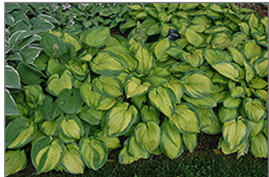
Paradigm Hosta