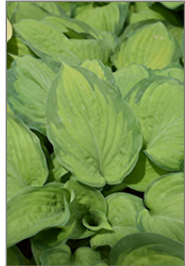
Paradigm Hosta foliage

This plant does best in partial shade to shade. It prefers to grow in average to moist conditions, and shouldn't be allowed to dry out. It is not particular as to soil type or pH. It is somewhat tolerant of urban pollution. This particular variety is an interspecific hybrid. It can be propagated by division; however, as a cultivated variety, be aware that it may be subject to certain restrictions or prohibitions on propagation.