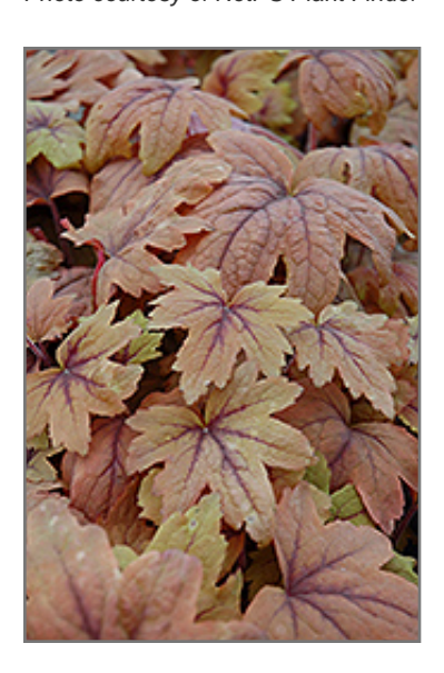
Sweet Tea Foamy Bells foliage