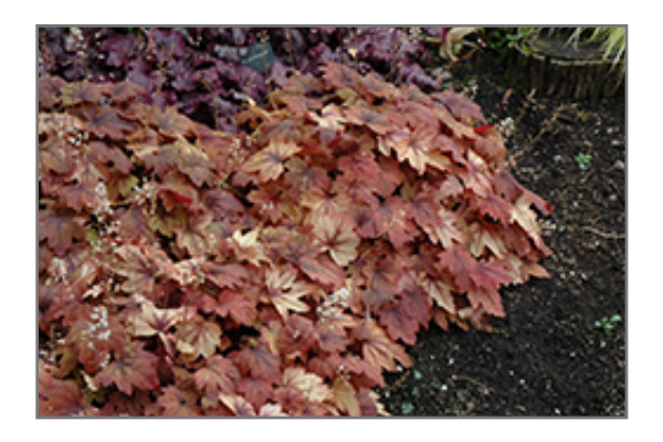
Sweet Tea Foamy Bells

Sweet Tea Foamy Bells will grow to be about 20 inches tall at maturity, with a spread of 28 inches. When grown in masses or used as a bedding plant, individual plants should be spaced approximately 24 inches apart. Its foliage tends to remain dense right to the ground, not requiring facer plants in front. It grows at a medium rate, and under ideal conditions can be expected to live for approximately 10 years. As an evegreen perennial, this plant will typically keep its form and foliage year-round.