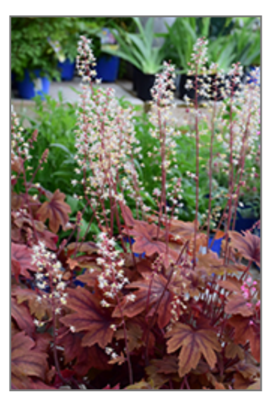
Sweet Tea Foamy Bells in bloom

Sweet Tea Foamy Bells is recommended for the following landscape applications;