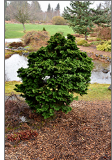
Dwarf Hinoki Falsecypress

Dwarf Hinoki Falsecypress will grow to be about 4 feet tall at maturity, with a spread of 4 feet. It tends to fill out right to the ground and therefore doesn't necessarily require facer plants in front. It grows at a medium rate, and under ideal conditions can be expected to live for 40 years or more.