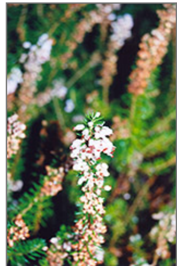
Scotch Heather flowers