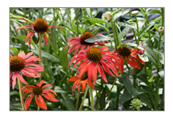
Tomato Soup Coneflower flowers

401 Torbay Road St. Johns, NL A1C 5C9 (709)726-1283 (877)726-1283