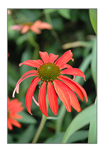
Tomato Soup Coneflower flowers